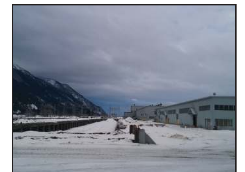
View of where potroom 1 was located. The general warehouse is visible on the right side of the picture.