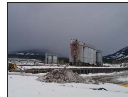
View of where potrooms 3, 2 and 1 were located. West alumina ore silos are visible in center of this picture.