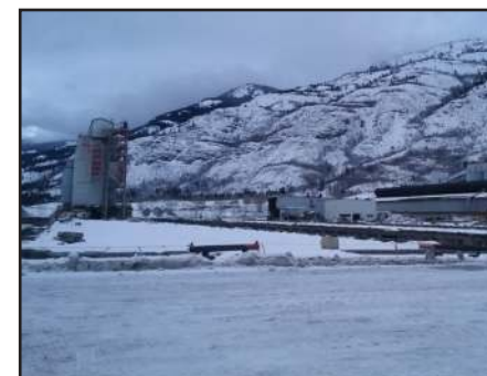
View of where potrooms 3 and 4 were located. Potroom 5 is visible on right side of picture

The overall work associated with the RI/FS began in early 2016 and is expected to continue into 2021.