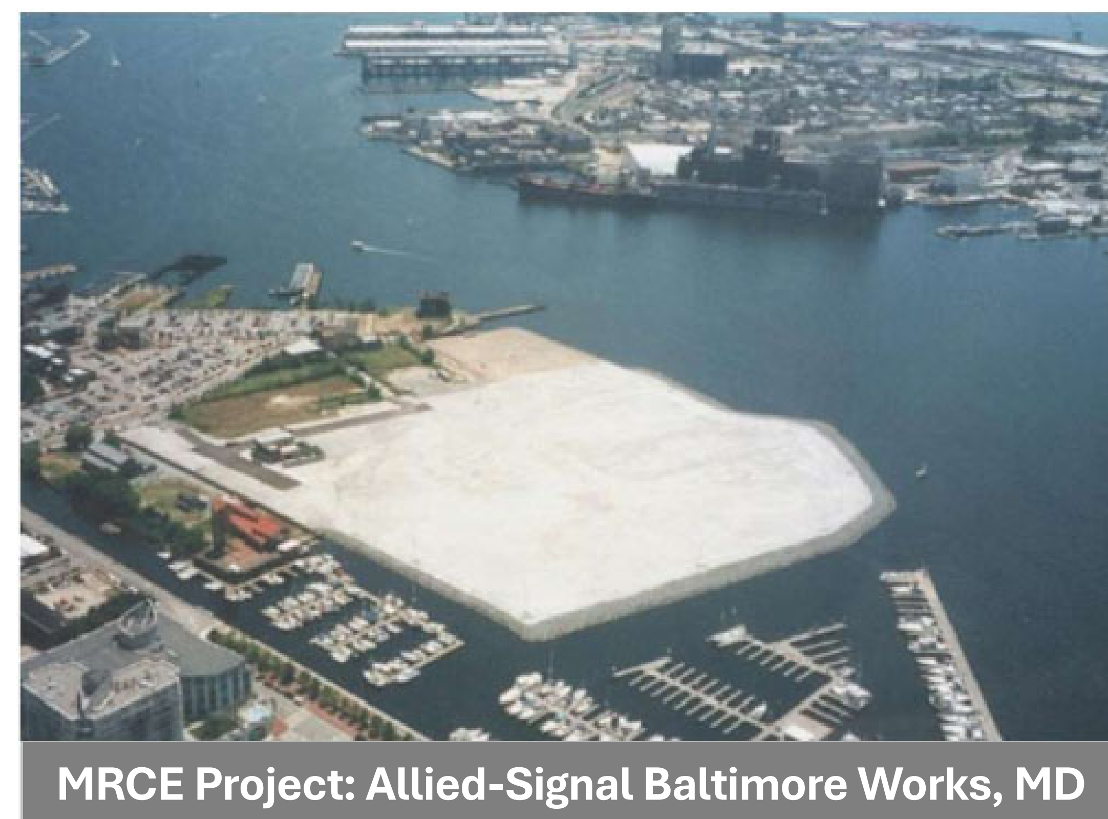
MRCE Project: Allied-Signal Baltimore Works, MD