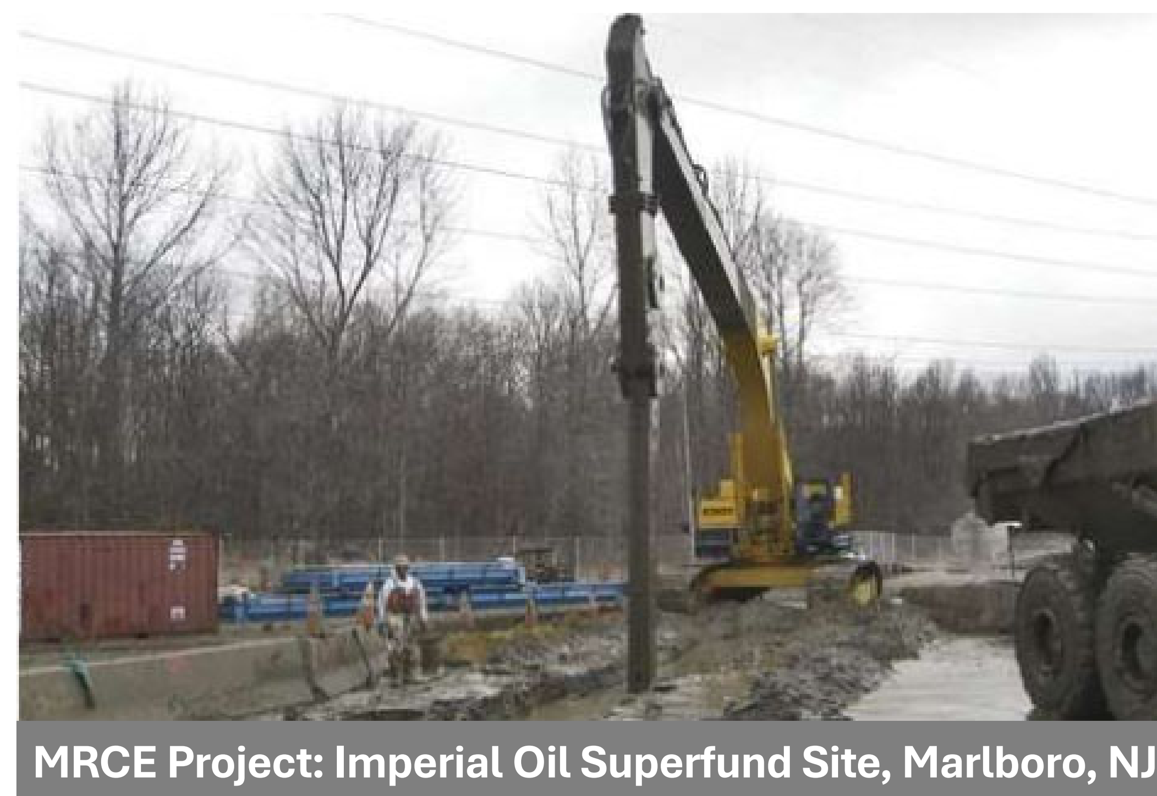
MRCE Project: Imperial Oil Superfund Site, Marlboro, NJ